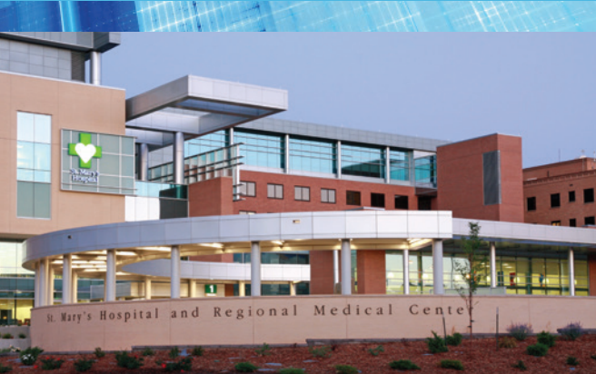
St. Mary's Hospital, Grand Junction, CO