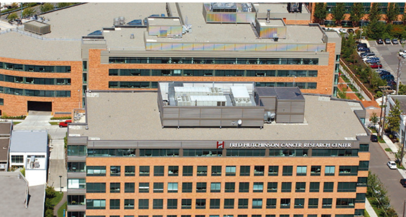
Fred Hutchinson Cancer Center, Seattle, WA

Carlisle SynTec roof systems have been installed on more than 25,000 healthcare facilities covering more than one billion square feet. This wealth of experience has provided us with a clear understanding of the specialized design and construction challenges healthcare facilities face. The importance of ensuring the safety and quality of care for patients, staff, and visitors is of critical concern within the healthcare industry. Recognizing these concerns, Carlisle SynTec Systems has developed unique, long-term solutions to meet the specific roofing needs of healthcare facilities.