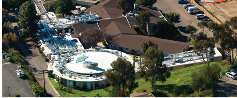
Jacob Health Care, San Diego, CA