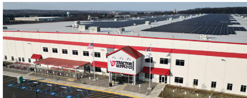
The Tractor Supply Distribution Center (Navarre, OH) was one of the large-scale projects that contributed to Mid-South Roof Systems (left) receiving the 100 Million Square Feet award.