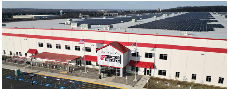
The Tractor Supply Distribution Center (Navarre, OH) was one of the large-scale projects that contributed to Mid-South Roof Systems (left) receiving the 100 Million Square Feet award.