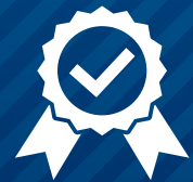
QUALITY OF WORKMANSHIP