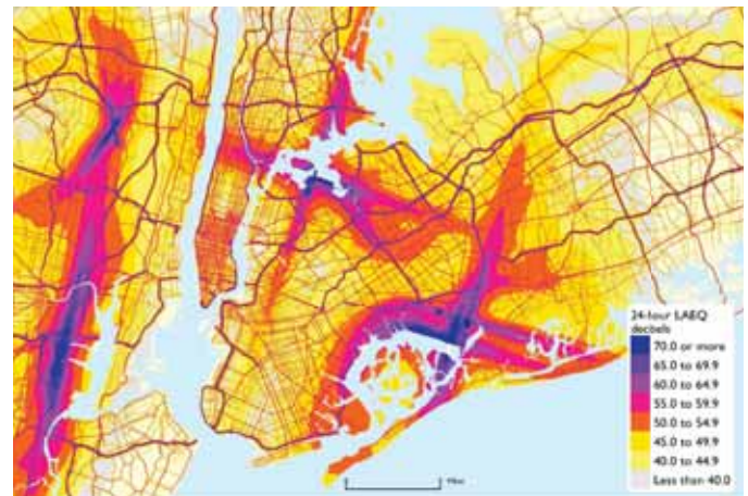
AVIATION AND HIGHWAY NOISE FOR THE NEW YORK CITY METROPOLITAN AREA: 2014

Should you consider noise pollution when designing a roof? The National Transportation Noise Map is a good starting point. As an example, please see the picture of New York City below. A score of 70 (blue area) is equivalent to the sound produced by a vacuum or garbage disposal.