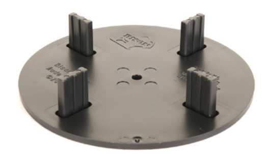
Ultra Low Height Pedestal