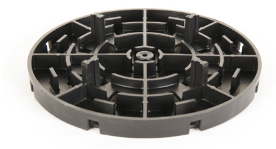
Fixed Height Stackable Pedestal