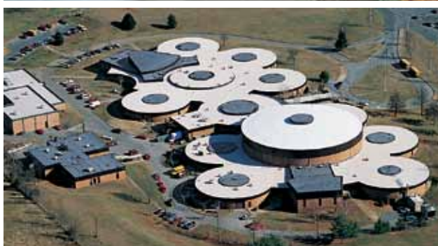
The development of complementary technologies has allowed EPDM to be beneficial in a wide number of applications, including plaza decks and larger projects using white EPDM membrane. Pictured (above) is a plaza deck paver system installed over a 145-mil EPDM system and (below) a white EPDM roof system.

In May of 2008, SPRI released a final report on a joint study with the Department of Energy (DOE) and the EPDM Roofing Association (ERA) entitled, "Evaluating the Energy Performance of Ballasted Roof Systems." The study shows that ballast and paver systems can save as much energy as a reflective or "cool" roof—even in southern climates.