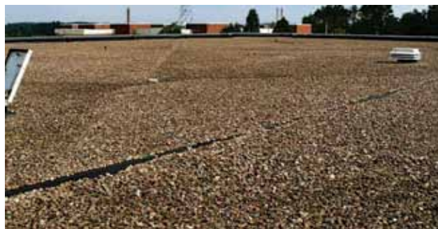
The 29-year-old EPDM roof protecting the Jamerich Building at Northern Michigan University in Marquette, Mich., is still performing well.

house facility; West Bend, Wisc. 5) A fully adhered 45-mil EPDM (sample age: 29 years); Barrington Combined Community School District 220 Headquarters; Barrington, Ill.