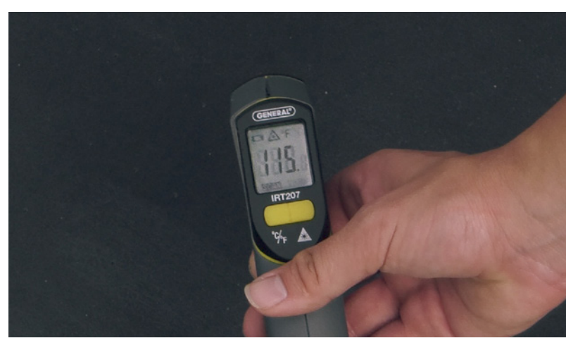
The pictures above show the temperatures of the facers on a 75F, partly sunny day.