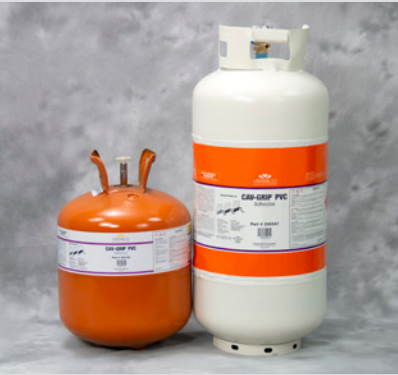
Small canister: 750 sq ft | Large Canister: 1500 sq ft

The Versatile Solution Perfect For A Multitude of Applications