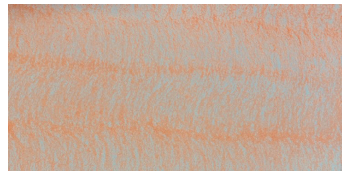
Proper Coverage on Membrane