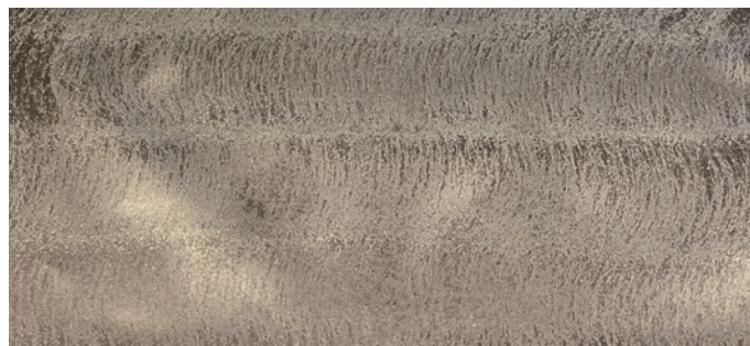
Proper Coverage on Membrane