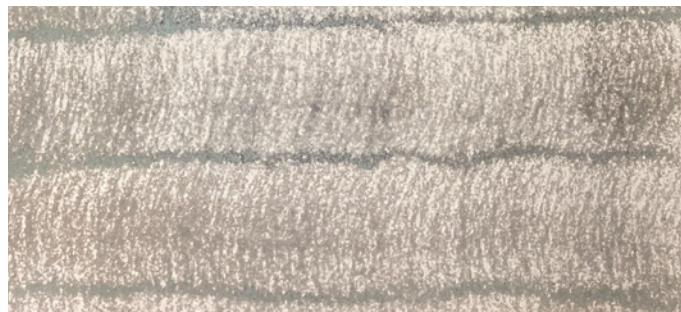
Proper Coverage on Insulation