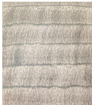
Proper Coverage on Insulation