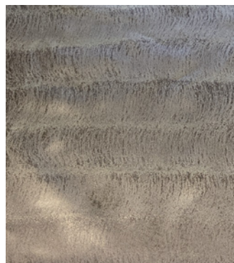
Proper Coverage on Membrane