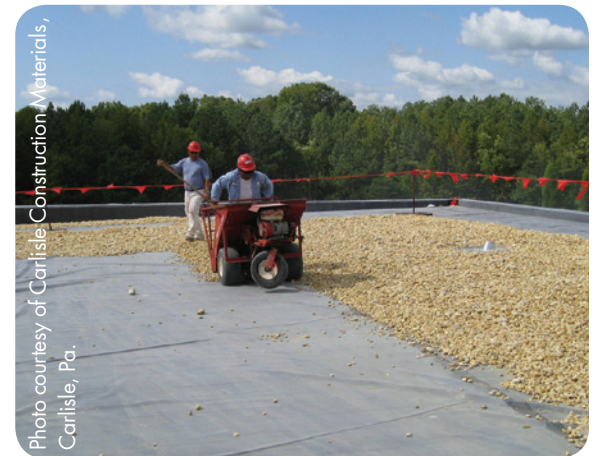
Roofing professionals spread ballast and level out the stones to ensure even coverage.

No fasteners or bonding adhesives are used in a ballasted system's field. As a result, no volatile organic compounds are emitted into the atmosphere and building occupants are not disrupted by bothersome odors. Furthermore, because no fasteners are used for a ballasted assembly, thermal bridging is not an issue. It is estimated that between 3 and 8 percent of insulation's R-value is lost when mechanical fasteners are used in a roof's field.