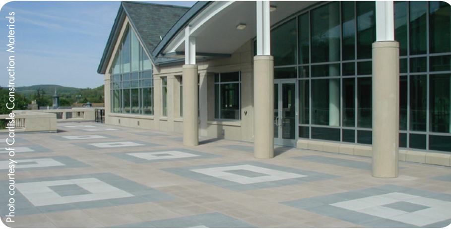
Pavers, another form of ballast, are aesthetically pleasing and can add usable space to a facility.

modified to absorb and retain stormwater. The modification is achieved by adding more drainage components, specifically drainage board or moisture-retention mats. This alteration to a traditional ballasted assembly can allow the system to retain as much as 70 percent of the water from a 24-hour rain event, providing significant relief to city sewer systems. However, it can add weight to the roof system.