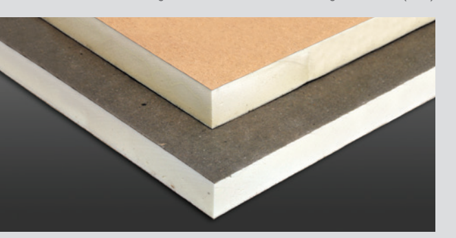
Light- and dark-colored glass reinforced felt (GRF) facers

As the single-ply roofing industry leader, Versico Roofing Systems takes pride in its tradition of continuous innovation. With the introduction of ReadyFlash Technology for VersiCore® flat, SecurShield® flat and SecurShield HD products, Versico continues to shape the evolution of the commercial roofing industry through the development of world-class products.