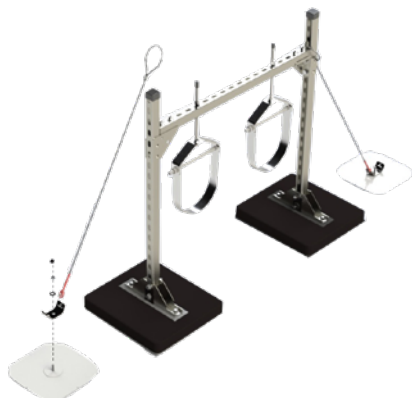
Guy Wire Tie Down Kit