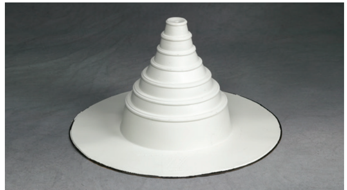
Sure-White Pressure-Sensitive Pre-Molded Pipe Seal